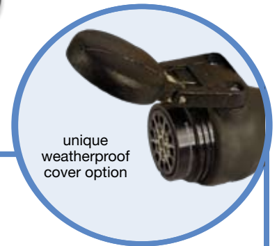
unique weatherproof cover option