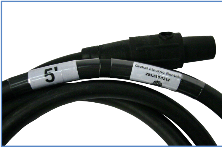
Cable with standard length label and optional custom label shown.

Laminated Vinyl Labels for all Lex Cable Assemblies