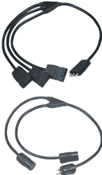
Standard All Black Connectors