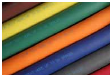
Custom “Legend” Printing