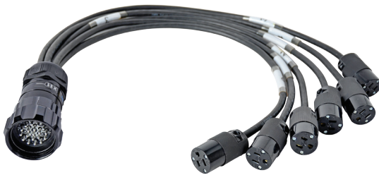
Break-Out male LSC19 to (6) female 15 Amp NEMA 5-15